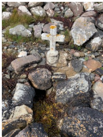
holy well of St. Dymphna