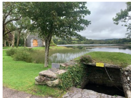
St. Finbar's well